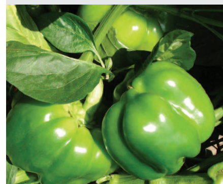
Efficacy of Portal on Broad Mite in Pepper