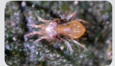
Two-spotted Spider Mite