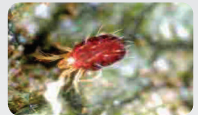
Carmine Spider Mite