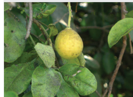
Black Sooty Mold on Grapefruit