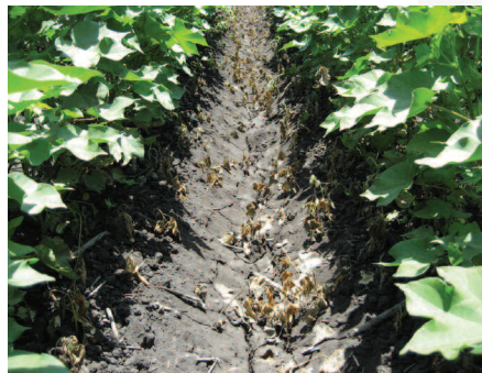
2 Days After Treatment