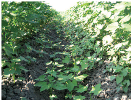
Morningglory Before Treatment